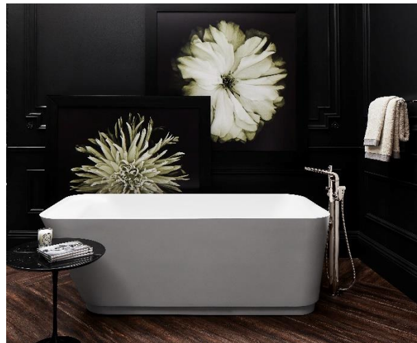
The contemporary DXV Modulus freestanding tub exhibits functional elegance with its softly angular design lines, ideal for deep soaking luxury with its 81-gallon capacity.

With a pared down and fundamentally modern aesthetic, the DXV Modulus one-piece toilet features a slim, high back tank and an angular, monolithic design. Completing the offering are the compact DXV Modulus wall mounted toilet and bidet models , ideal for smaller spaces. Both fixtures feature clean, concealed tank designs that incorporate the exclusive GROHE Rapid SL in-wall carrier system . The actuator plate for the