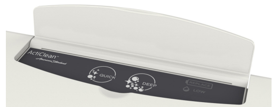
SELF-CLEANING TANK TOP DEVICE

SEE REVERSE FOR ADDITIONAL ROUGHING-IN DIMENSIONS